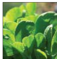
Pea Shoots 10781