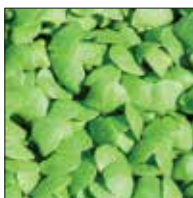
Basil, Italian Genovese 10779