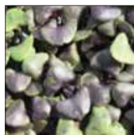
Opal Basil 10883