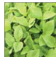
Lemon Basil 10795