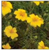
Blooming Citrus Lace 11755