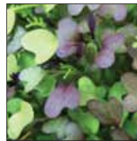
Spicy Mix Mustard 10873