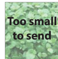
Too small to send

Greenleaf Ordering Schedule: ◆ Order by Friday noon for delivery on Sunday or Monday. ◆ Order by Monday noon for delivery on Wednesday. ◆ Order by Wednesday noon for delivery on Friday.