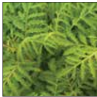
Citrus Lace 10843