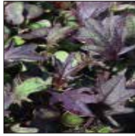
Burgundy Kale 11702