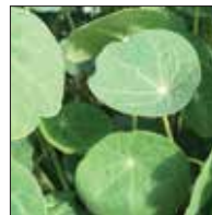
Empress of India Nasturtiums 11151