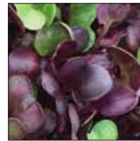
Purple Radish 10924