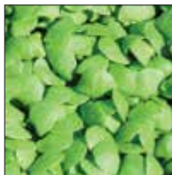
Basil, Italian Genovese 10779