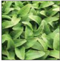
Thai Basil 11299