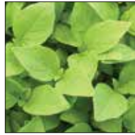
Lemon Basil 10795