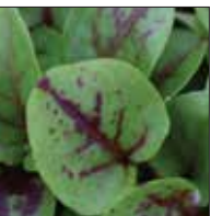
Red Veined Sorrel 10895