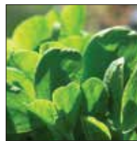
Pea Shoots 10781