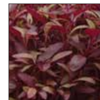
Garnet Amaranth 10780

Greenleaf Ordering Schedule: ◆ Order by Friday noon for delivery on Sunday or Monday. ◆ Order by Monday noon for delivery on Wednesday. ◆ Order by Wednesday noon for delivery on Friday.