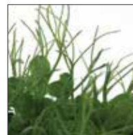
Frilly Pea 10826