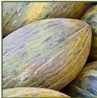
Full Belly Farm #10315, 10324