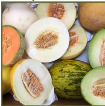
Full Belly Farm #13843