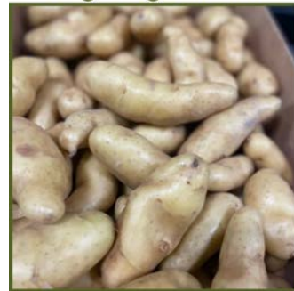
Full Belly Farm #2435, 25lb, $75