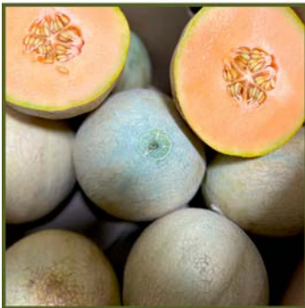
Full Belly Farm #1757, #1758