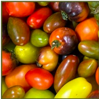
Comanche Creek Farms #8141, 12lb, $44