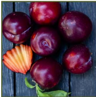
Frog Hollow Farm #6066, 10lb, $41.50