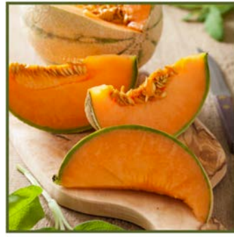
Full Belly Farm #1773, #1774