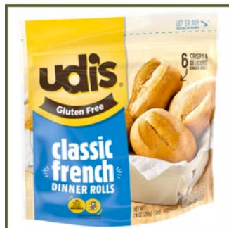
Udi's #15115 *Pre-order