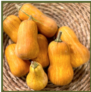
Durst Organic Growers #13911, #13912