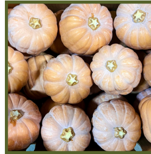
Comanche Creek/Row 7 #14893, #14894