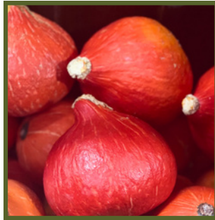
Durst Organic Growers #3306, #3307