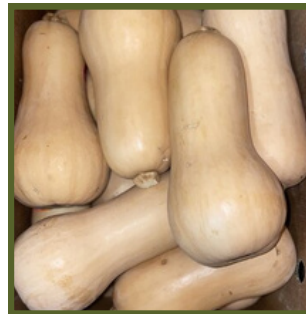
Coke Farms #3279, #6311