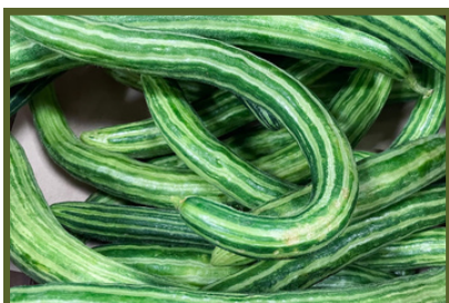
Riverdog Farm Item #0955 $36.00 per 10lb pack