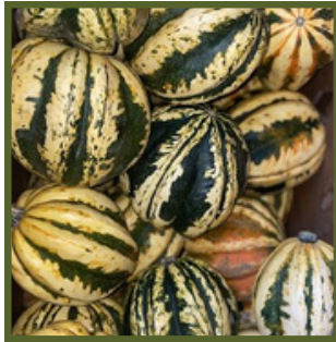
Coke Farm #3282, 3283