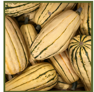
Coke/Comanche Creek #11455, #11456