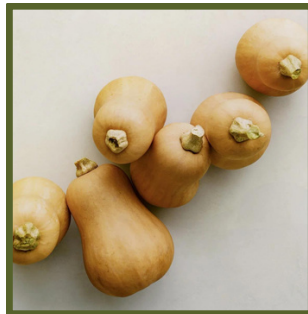
Comanche Creek/Row 7 #15168, #15169